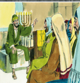
...during the period of the New Testament Church. Paul taught in the "syn_gog_e e_ery S_ _bath." -Acts 18:4