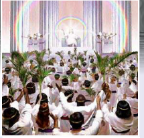
In the "New He_vens and New Ea_th", all "flesh" will come together to worship every "Sab_ath" day. -Isaiah 66:22, 23

5) What does the Bible say we should rest from on the Sabbath day? -Jeremiah 17:21, 22, Nehemiah 13:16, 17, Isaiah 58:13 1 - We must NOT "do any wo_k" on the "Sa_ ath day.